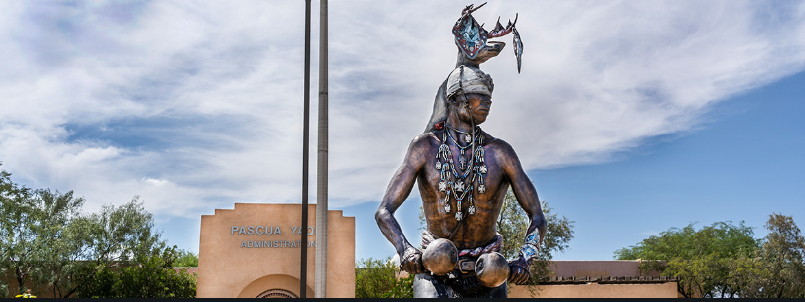
The Yaqui Deer Dancer (pictured) derives from the Sewa Ania (flower World), and symbolizes our connection to the Huyya Ania (Wilderness World) and all its inhabitants.